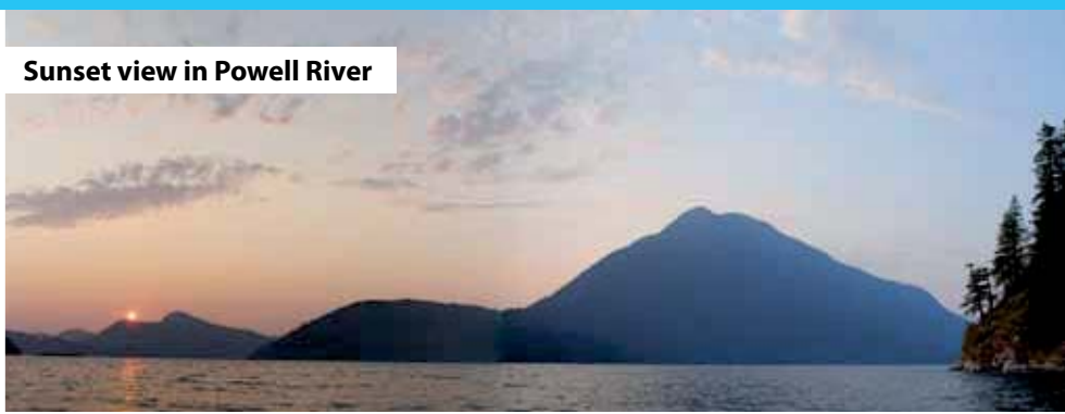
Sunset view in Powell River

Forever! Leave your mark at Camber College. Paint and decorate your message on the walls and be immortalized forever.